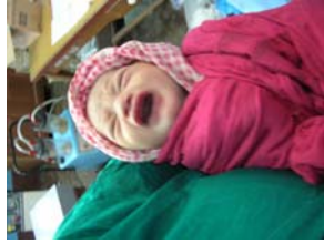
The first child to be delivered by C-section in Khandbari, Nepal

March 2005 was a very special month for Helping Hands Nepal, as it was organizing a special surgical camp in Khandbari, Nepal. This camp entirely focused on women's cases and provided exclusive services for women in need of health care. The biggest achievement of this camp was the first baby delivered by C-section in Khandbari, Nepal. For this